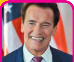
Governor Arnold Schwarzenegger