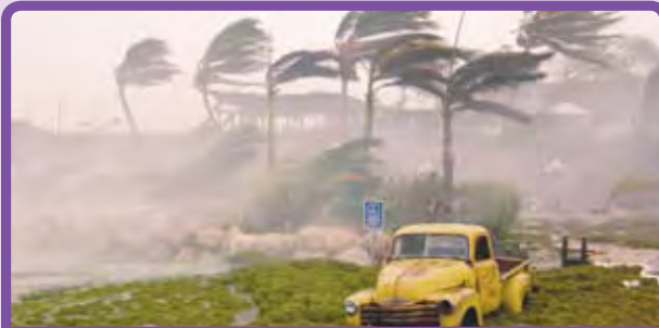
Hurricane season will end on November 30.

Both the program and human experts have made the same prediction: four to