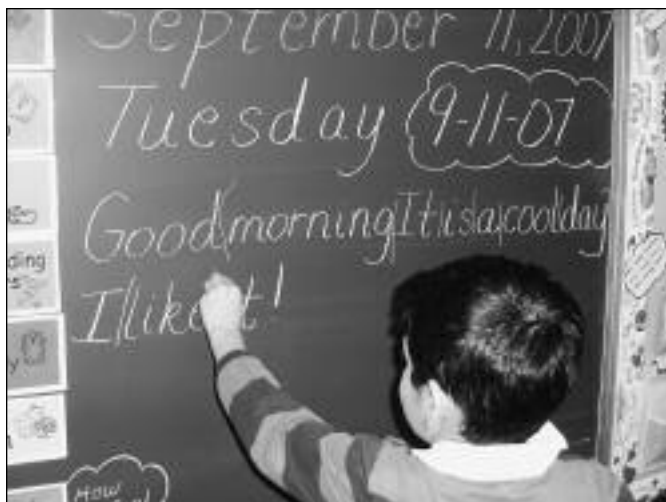
Morning Message: Spaces Between Words

Many young children who are beginning to write words find it difficult to leave appropriate spacing between the words. For most students, this skill improves with time and practice. To help students remember to leave spaces between words as they write, demonstrate how to place a