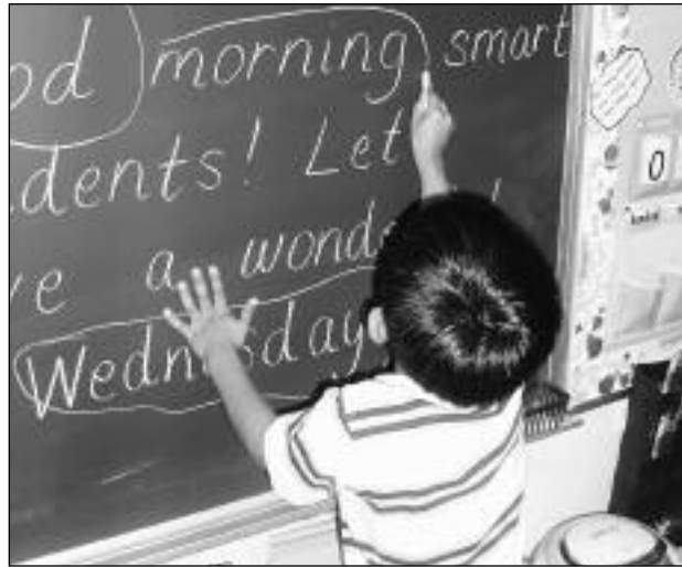
Morning Message: What Do You Notice?

another child might remark that some words are written in all capital letters. Both observations will lead you to meaningful discussions about words and the choices authors make while writing. To encourage noticing, invite students to raise hands, individually come to the board or chart, tell the class what they've noticed, and mark it in some way. You can use a message similar to this throughout the year to highlight specific word patterns, conventions, sentence parts, or other language concepts you wish to emphasize.