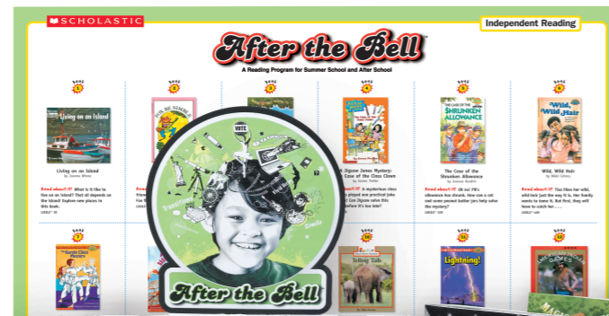
Components for Level 3 are shown