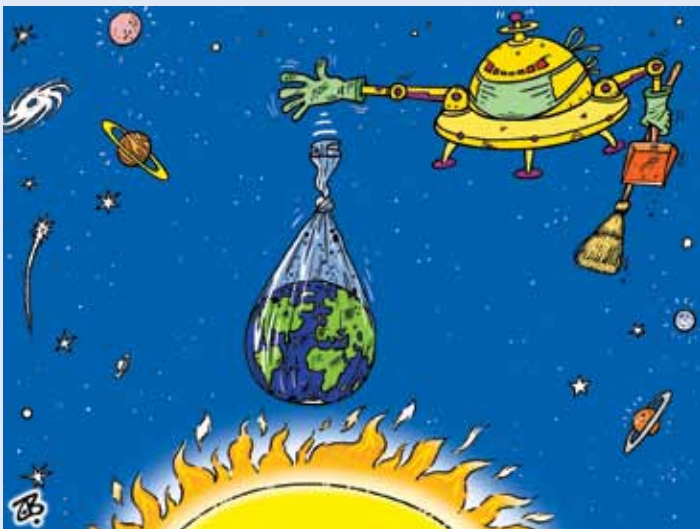
EMAD HAJJAJ • (JORDAN) • CAGLE