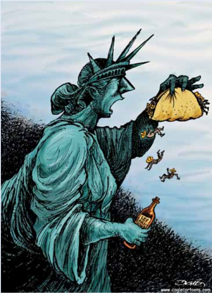
DARIO CASTILLEJOS • DARIO LA CRISIS (MEXICO) • CAGLE