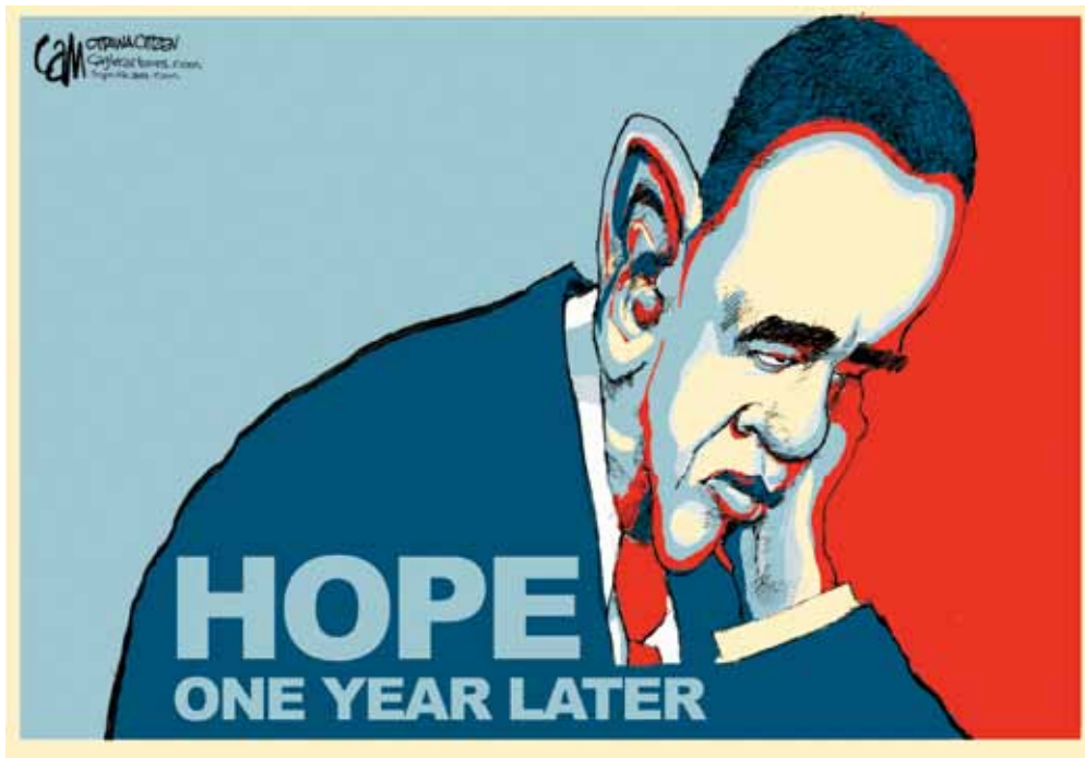
CAM CARDOW • OTTAWA CITIZEN (CANADA) • CAGLE

Available as a whiteboard-ready PDF at upfrontmagazine.com