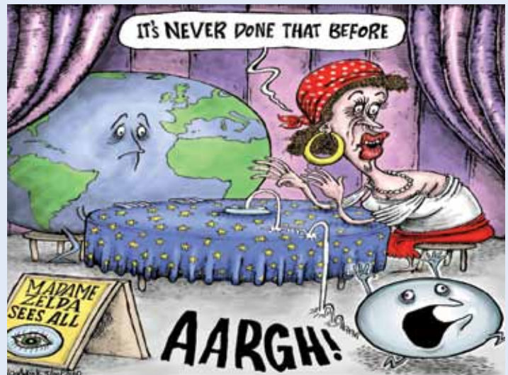
BRIAN ADCOCK • THE SCOTLAND ON SUNDAY (UNITED KINGDOM) • CAGLE