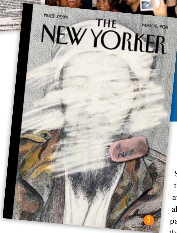
1. News of the devastating attacks of 9/11. 2. After bin Laden's death, people gathered in celebration in front of the White House in Washington, D.C. 3. The New Yorker published this cover of bin Laden after he was killed. What do you think it means?