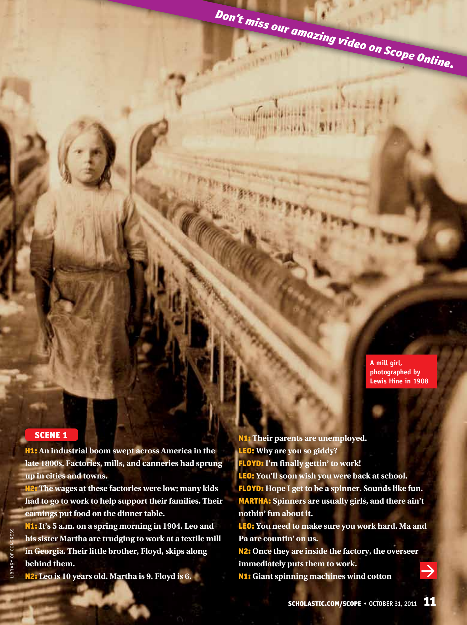
A mill girl, photographed by Lewis Hine in 1908

Don't miss our amazing video on Scope Online.