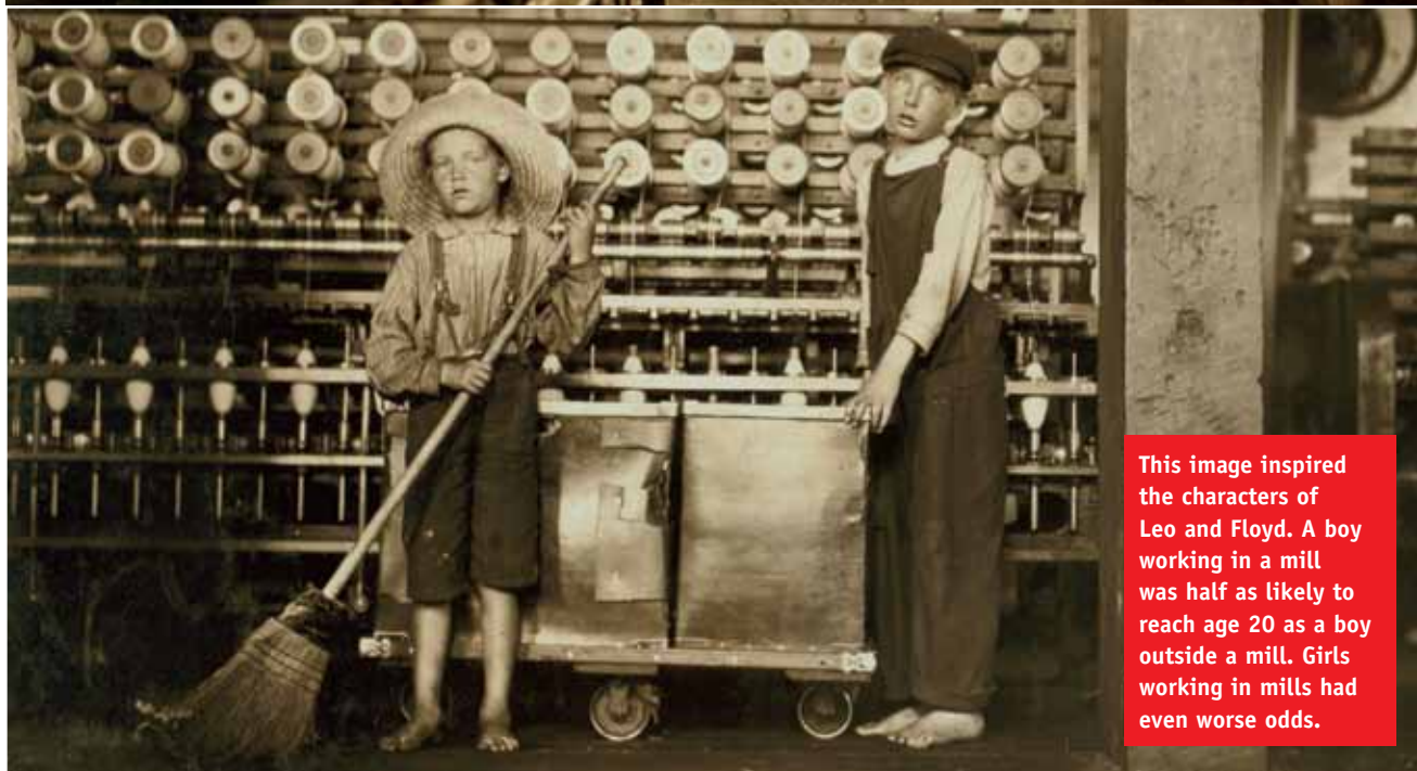
This image inspired the characters of Leo and Floyd. A boy working in a mill was half as likely to reach age 20 as a boy outside a mill. Girls working in mills had even worse odds.

thread around hundreds of large bobbins .