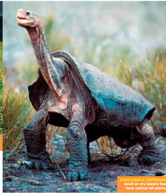
SADDLEBACK TORTOISES dwell on dry islands that have various tall plants.