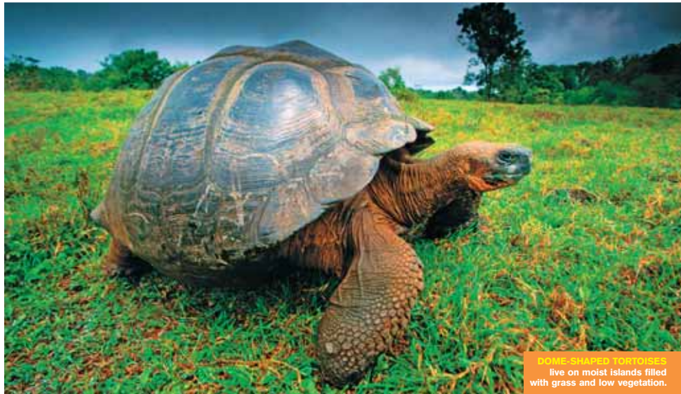
DOME-SHAPED TORTOISES live on moist islands filled with grass and low vegetation.